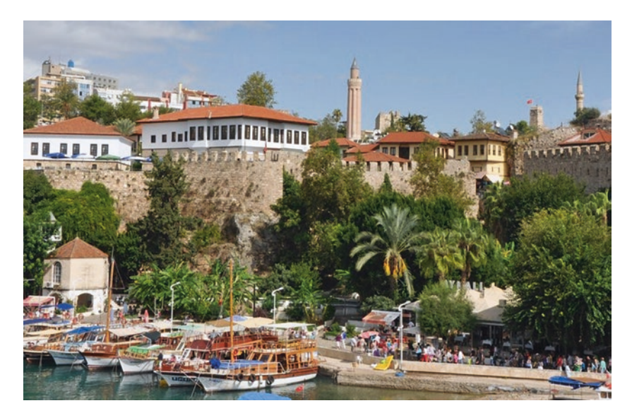
Fig. 1.2 Antalya's city harbor and its walls

In this light, one should also consider how each of regions boasted rather fluid and variable governmental structures and political allegiance to the center as local urban elites showed a unique understanding of the socio-economic, military, and cross-cultural dynamics characterizing the urban life in the Medieval Mediterranean (Valérian 2014). These were not indeed peculiar to the so-called periphery only, for an important city like Attaleia (mod. Antalya; see Fig. 1.2) -on which I will also return later- can be effectively be defined as a thematic capital of the Byzantine heartland and an imperial navy-base fully engrained in Constantinopolitan-centered hierarchic defensive network as set up in the late seventh century (Foss 1996, 4-13); but at the same time, the city could also be regarded as a liminal site exposed to diverse cultural influences, a fully developed mercantile harbor which remained operative until it was lost to Byzantium post-1204 and -as Demetris Krallis (2019, 66) cogently proved- as a citystate, operationally semi-independent, able to fend for itself and whose elites were deeply involved in the shipping and trading networks linking southern Anatolia with Cyprus and the Levant (Zavagno 2011). Sheltered